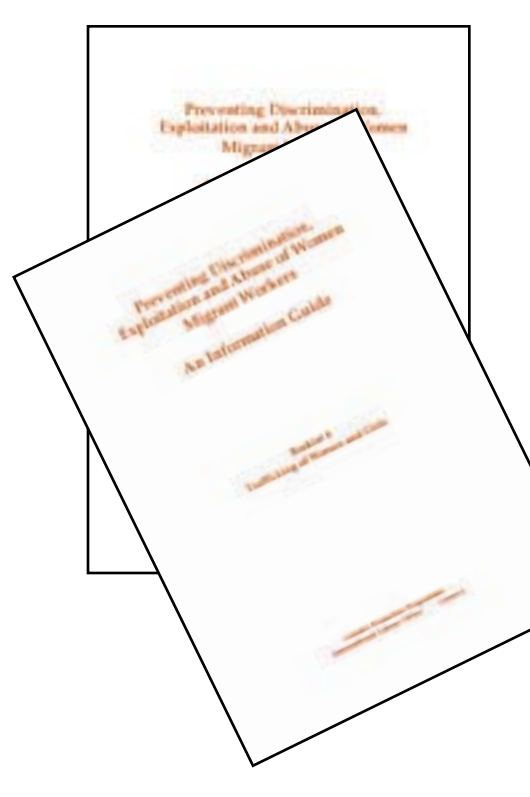
Guide Booklets available in .pdf format at www.ilo.org

victims. It points out that trafficking in human beings is, first and foremost, a violation of human rights; it should not be dealt with merely from the perspective of fighting illegal migration nor protecting national interests. A wide range of actors need to tackle the entire cycle of trafficking through policy, action and cooperation at different levels for the prevention of trafficking, support for and protection of victims and prosecution of traffickers.