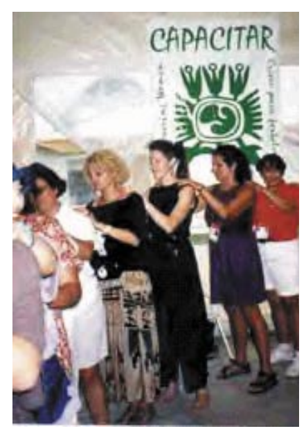
Capacitar program participants giving the drum massage during one session.