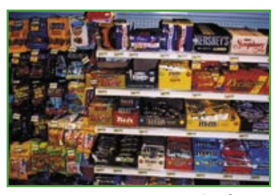
SNJM Justice Photo