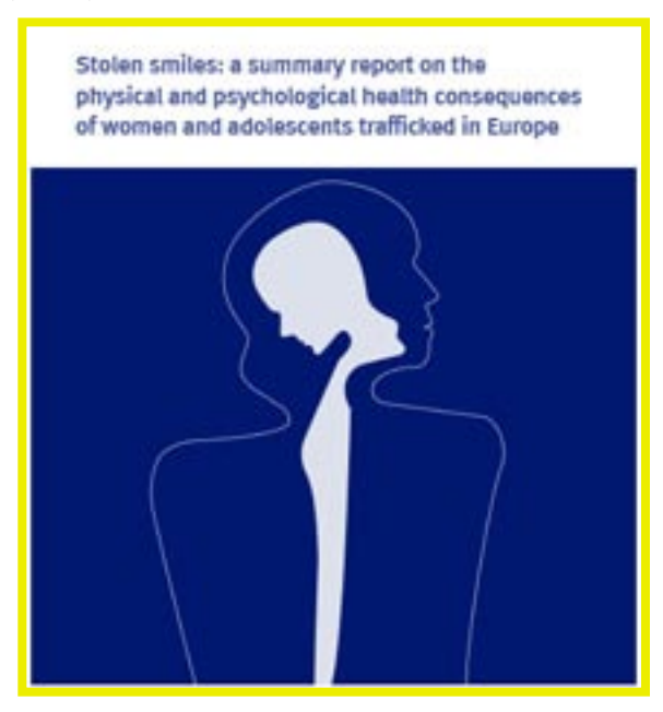
"I feel like they've taken my smile and I can never have it back." Lithuanian woman trafficked to London