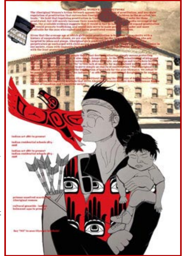
"Let Vancouver enter into the 2010 Olympics without wearing the black-eye of decriminalized prostitution and legalized brothels that drive Aboriginal women further down the human rights ladder of Canadian and Vancouver society." AWAN

We, the Aboriginal Women's Action Network, speak especially in the interests of the most vulnerable women - street prostitutes, of which a significant number are young Aboriginal women and girls. We have a long, multi-generational history of colonization, marginalization, and displacement from our Homelands, and rampant abuses that has forced many of our sisters into prostitution. Aboriginal women are often either forced into prostitution, trafficked into prostitution or are facing that possibility. Given that the average age at which girls enter prostitution is fourteen, the majority with a history of unspeakable abuses,