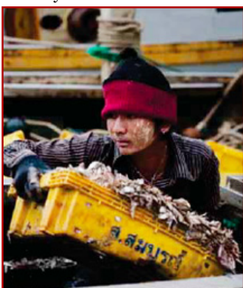
2012 TIP Report pg. 28

Phatthana Seafood is accused of paying low wages to workers, as well as keeping a percentage of these wages against the debt incurred by workers for travel to the factory (a form of "debt bondage"). Phatthana Seafood also retains the workers' passports and releases them only for a heavy fee.