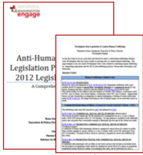
WA State 3 P's Legislation

The Washington Engage website delineates the laws that have been enacted to date, by categorizing them under the 3 P's (Prosecution, Prevention, Protection). One may download the summary of anti-trafficking legislation up through 2011 and the 12 pieces of legislation passed in 2012. Go to: http://waengage.com/wa-legislation/