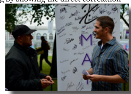
Getting committment by signing a MATTOO banner at the 2012 Olympics

MATTOO invites men to hold MATTOOstyle Educational-FUNdraisers: • 'Texas