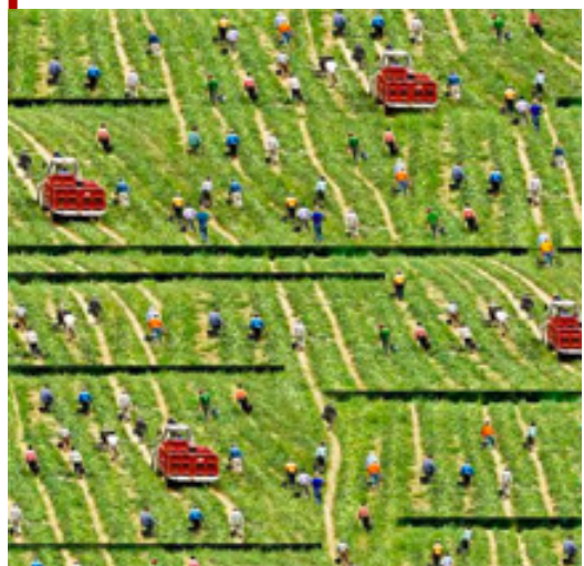
"People want their food to be cheap. Without a fair price will there ever be fair working conditions?" "Lowest on the Foodchain"

When male victims are not identified, they risk being treated as irregular migrants instead of exploited individuals and are vulnerable to deportation or being charged with crimes committed as a result of being trafficked, such as visa violations. Cases involving male victims are often dismissed as labor infractions instead of investigated as criminal cases. (TIP, pg. 35)