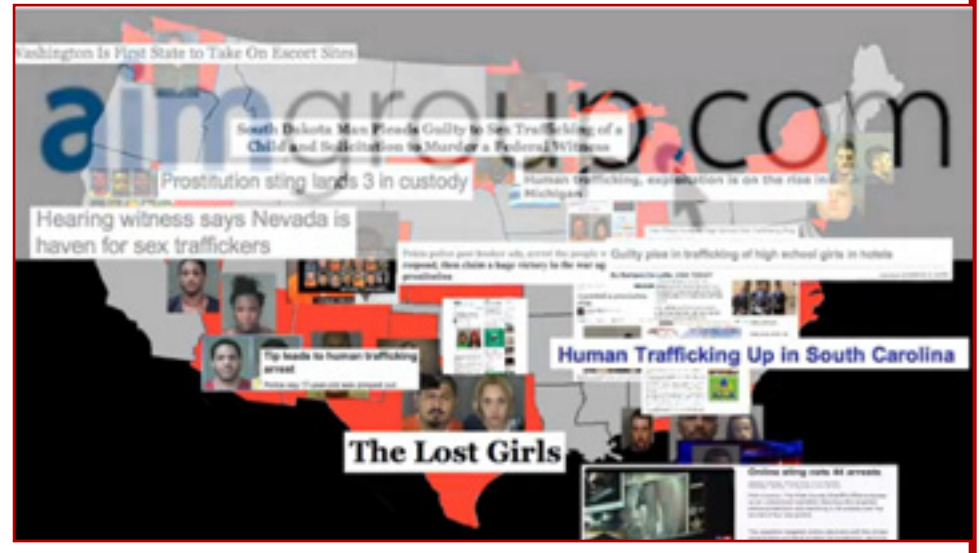
Sample of documented instances of human trafficking through Backpage.com