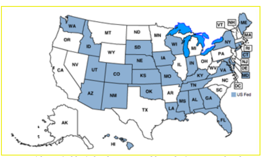
States (shown in blue) that have enacted laws during 2014 related to human trafficking. To date during 2014 69 bills have passed in 27 state legislatures.

(http://www.ozarksfirst.com/story/d/story/sunday-is-national-missing-childrens-day/34062/)