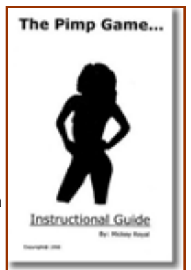
Example of one Internet-based 'training manual' for pimps.

Government intervention is necessary to end facilitation of sex trafficking by websites like Backpage.com .