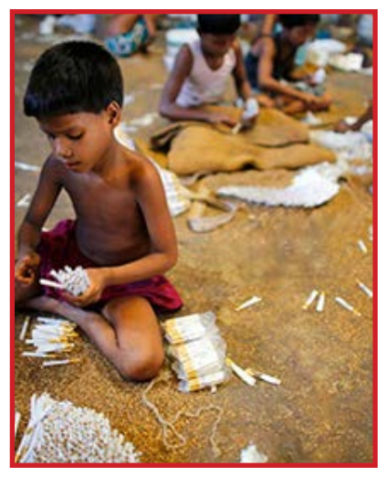
Bangladeshi children working off family debts by stuffing cigarettes with tobacco. (TIP, pg. 37)

Sex trafficking related to extractive industries often occurs with impunity. Areas where extraction activities occur may be difficult to access and lack meaningful government presence. Information on victim identification and law enforcement efforts in mining areas can be difficult to obtain or verify. Convictions for sex trafficking related to the extractive industries were lacking in 2014, despite the widespread scope of the problem. (TIP, pg. 19)