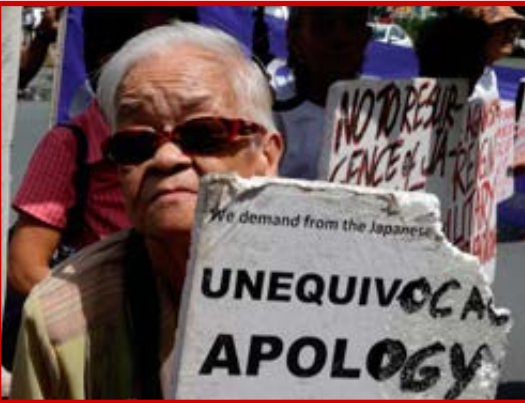
A Filipino "comfort woman" during World War II, now age 85, displays a placard during a rally outside the Japanese Embassy in Manila. inspired by the brave public testimo-

Most women procured for military sexual slavery came from the Philippines, Taiwan, Indonesia, Korea, and China. More than 100,000 of the women taken into sexual servitude were Korean. In the Philippines, Japanese soldiers pressed an estimated