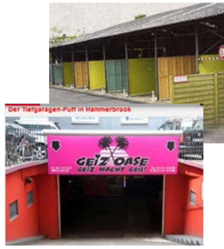
The sign reads 'Geiz macht Geil' -'Greed makes you horny'

In Germany, convenience and frugality are valued. Men can go to parking garages for drive-in sex, or visit stalls called 'Verrichtungsbox' ('getting things done' boxes). They can order women the way one would order a pizza with a mobile app produced in 2015.