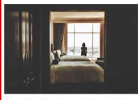
CITIZEN HOTELIER: COMPANIES EMBRACE SOCIAL RESPONSIBILITY

American children are at risk for exploitation. Youth are strategically targeted and manipulated by pimps who use hotel rooms as venues to abuse children, knowing that systems are not in place to protect the victims. With the use of online classified ads, child trafficking is moving off the streets and behind the closed doors of local hotel rooms. In addition, children are often transported from city to city via U.S. owned airlines and buses. Air travel is also a primary means of transportation for child sex tourists- individuals who travel overseas to sexually exploit local children.