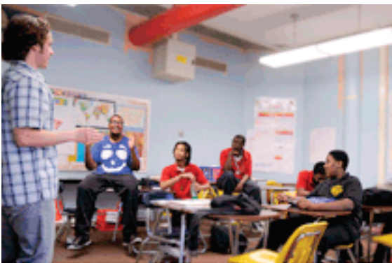
High school students at CAASE curriculum session.

“Ending Sexual Exploitation: Engaging Parents and Guardians of High-School-Age Sons to Stop Sexual Harm” is a resource created by CAASE for families, role models (i.e., parents, partners, stepparents, extended family members, etc.), and any other person who is involved in the lives of young men and is passionate about ending sexual exploitation.