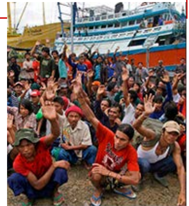
Men rescued raise their hands when asked, "Who wants to go home?"

She ran away from the recruiter to the Sierra Leonean Embassy and was placed in a Kuwaiti government-run shelter with approximately 300 other former domestic workers. Thema likely faces the same fate as other trafficking victims in Kuwait who run away from private homes—the cancellation of her residence permit and deportation. (TIP, pg.11)