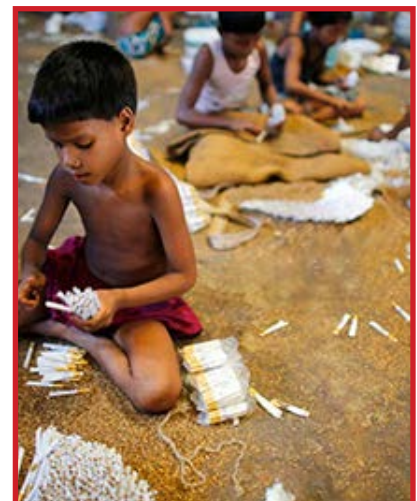
Bangladeshi children working off family debts by stuffing cigarettes with tobacco. (TIP, pg. 37)

Sex trafficking related to extractive industries often occurs with impunity. Areas where extraction activities occur may be difficult to access and lack meaningful government presence. Information on victim identification and law enforcement efforts in mining areas can be difficult to obtain or verify. Convictions for sex trafficking related to the extractive industries were lacking in 2014, despite the widespread scope of the problem. (TIP, pg. 19)