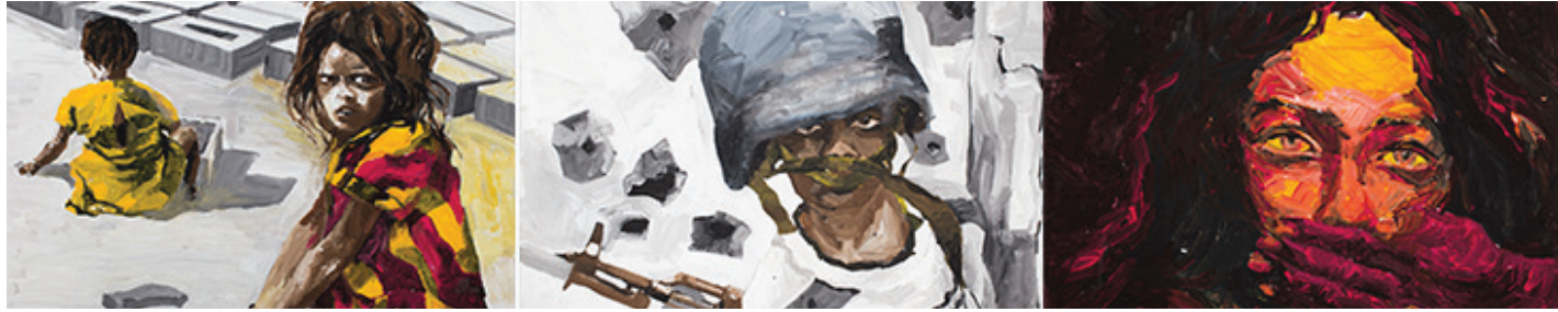
2016 UNODC Global Report on Trafficking in Persons

Other objectives of the Global Compact (7, 9, 12 and 14) also provide for specific trafficking-related actions aimed at ensuring protection, referral, counselling, and legal assistance. Objective 5 aims at enhancing availability and flexibility of pathways for regular migration.