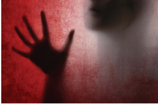
Senol Yaman, Young Girl Silouette, Shutterstock