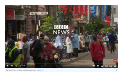
Baby Stealers - BBC Affica Bye documentary

They witnessed children being snatched from homeless mothers to be sold for as little as $390 (United